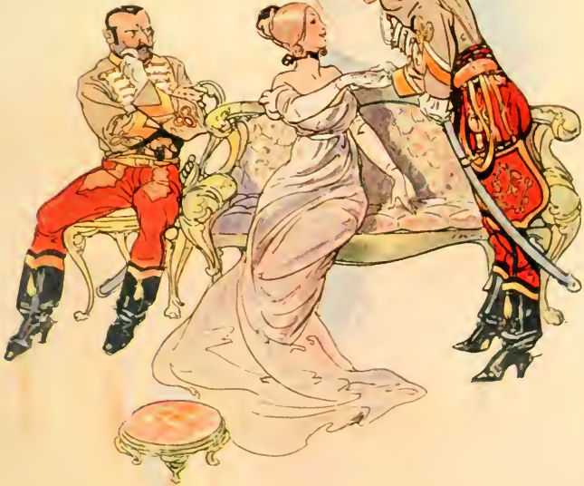
“ Bowing before a sylph-like form reclining on a couch ”